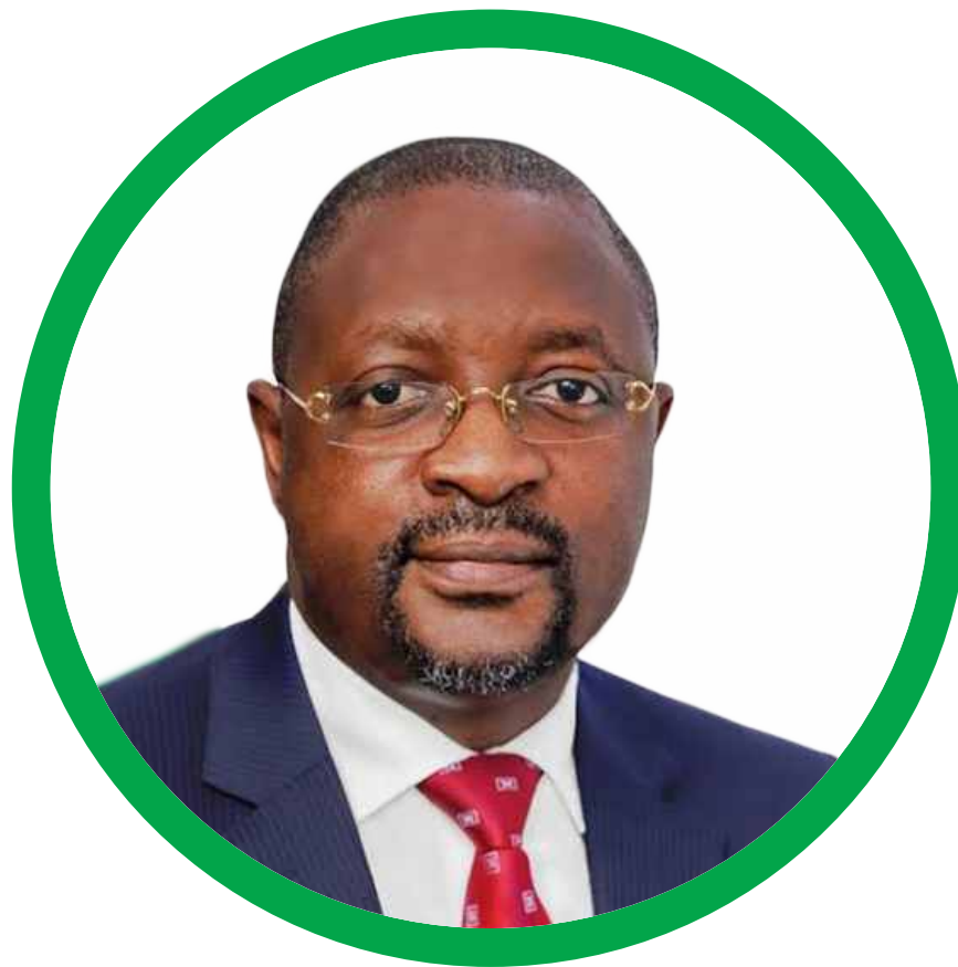
Mr. Sunday Dare Honourable Minister, Federal Ministry of Youths and Sports, OGP Nigeria incoming State Actors Co-chair.