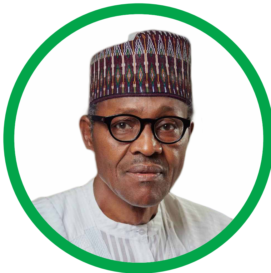
His Excellency Muhammadu Buhari (GCON, GCFR) President, Commander-in-Chief of the Armed Forces Federal Republic of Nigeria