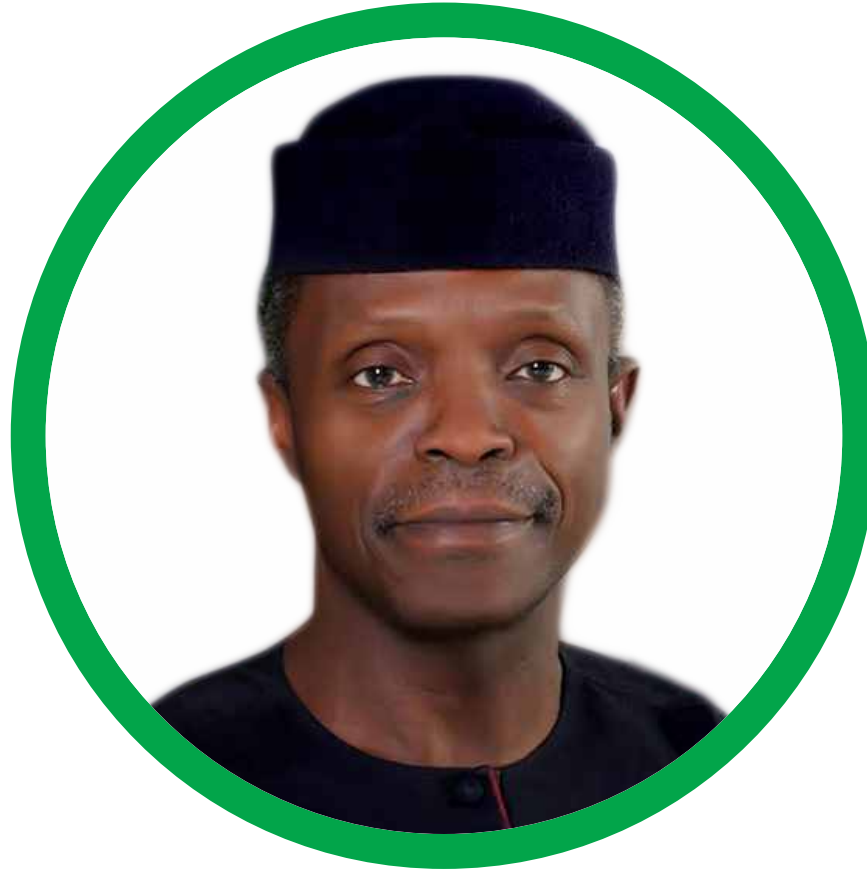
His Excellency Prof. Yemi Osinbajo (SAN) Vice President, Federal Republic of Nigeria